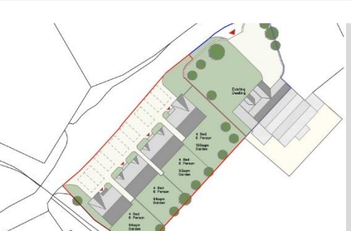
SOLD FOR £265,000 Guide Price: £250,000+

Land adj. 2 Stanley Cottages, Stoke Gifford, Bristol BS7 9YU