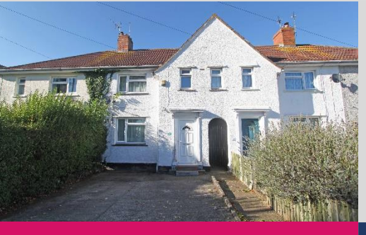
15 Ascot Road, Southmead, Bristol BS10 5SW